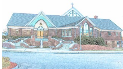
Artist's rendering of the church by Jeannine Migliorino